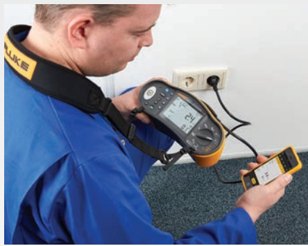
Fluke Cloud™ Storage Flexible and secure data storage from the field